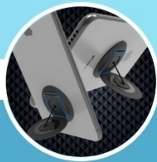
4-Way Locking Stand